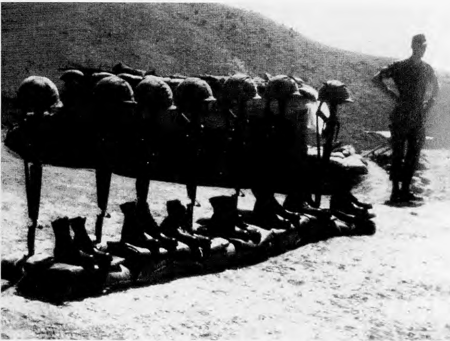
Memorial at Tomahawk to those from Bardstown killed during June and July of 1969.

"Then we began to find out the names of the others who had